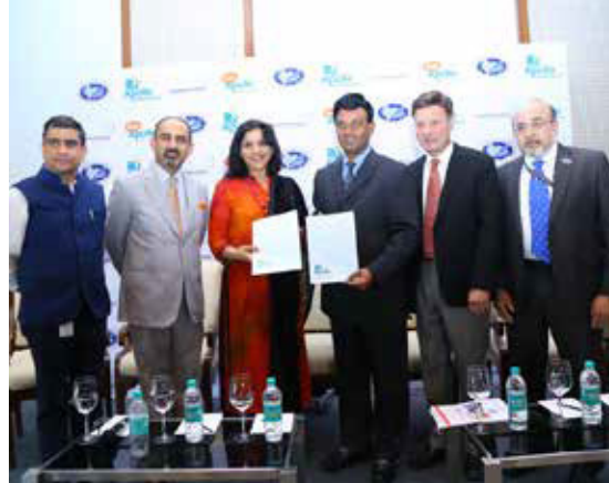
Apollo Hospitals-owned company signs MoU with AAPI

Apollomedics Super Specialty Hospital is the first hospital in Lucknow to successfully perform Brain surgery by stopping heartbeat for a while