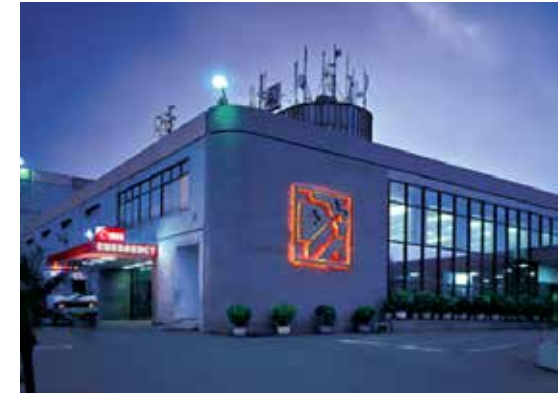
First Health City in Asia launched on June 15, 2007

Apollo Hospitals inaugurated in Bangalore.