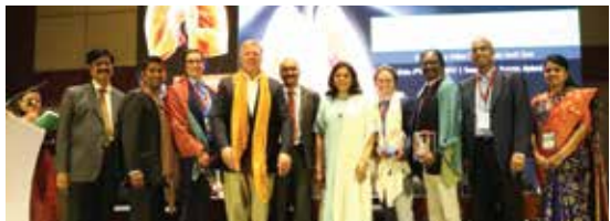
Apollo Hospitals, Hyderabad in collaboration with Montefiore Medical Center, New York hosted India's first exclusive conference on Lung Transplantation