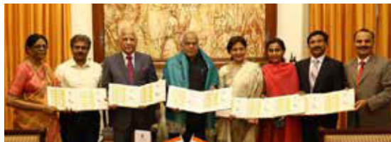
Apollo Hospitals Group has been honored with a postal stamp for successful completion of 20 million health checks and 36 years of healthcare excellence

Five Trans-Catheter Aortic Valve Replacements performed on a single day for the first time in India