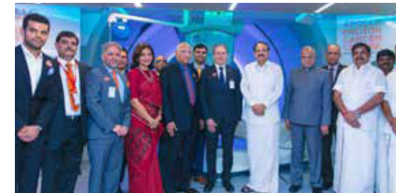
Apollo Hospitals inaugurated the Apollo Proton Cancer Centre , South East Asia's first Proton Therapy Centre for Cancer Care