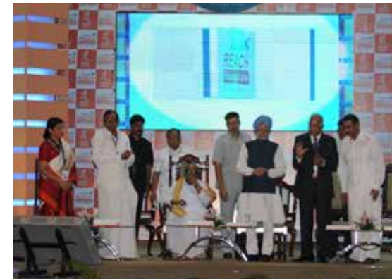
Apollo Reach Hospitals launched by Prime Minister of India.