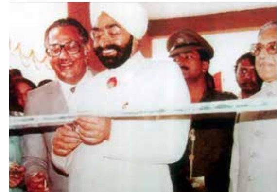
Inauguration of Apollo Hospitals, Chennai by Shri Giani Zail Singh (President of India).