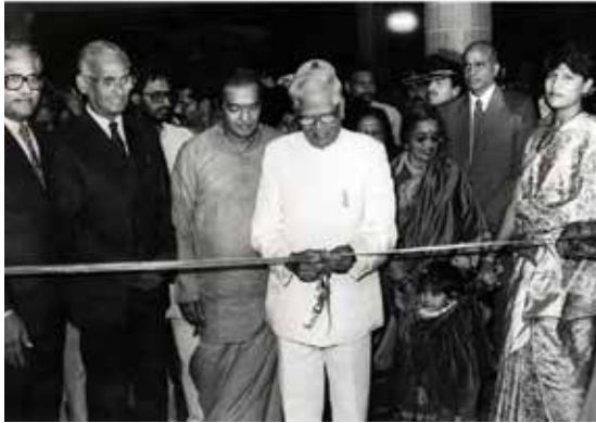
Apollo Hospitals inaugurated in Hyderabad.