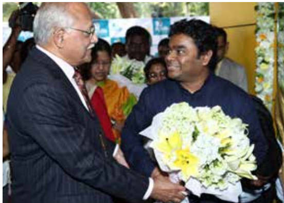
Oscar award-winner A.R.Rahman formally inaugurates the first Apollo Children's Hospital in Chennai.