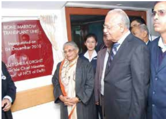
Novalis TX inaugurated at Indraprastha Apollo Hospitals by Smt. Sheila Dikshit, the Chief Minister of New Delhi.