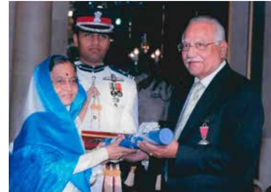
Dr. Prathap C Reddy is conferred with the Padma Vibhushan.