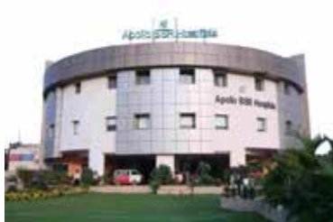
Apollo Hospitals inaugurated in Bilaspur and Mysore.