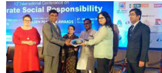
Golden Peacock Award for HR Excellence in healthcare sector

Apollo Hospitals, Kakinada launches the Neuro Navigation system , a first-of-its-kind in the coastal districts of Andhra Pradesh, for better patient care