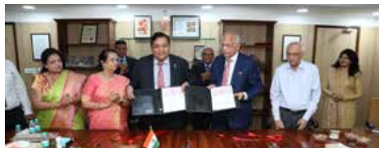
Apollo Hospitals Group has signed an agreement with NMMT for the operation and management of first multispecialty hospital in Navsari, Gujarat

Apollo Hospitals, Chennai has successfully performed India's first minimally invasive Robotic Hybrid Revascularisation surgery on a 63-year-old female patient