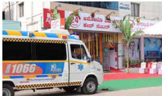
Apollo BGS Hospitals, Mysore starts its first Apollo Emergency Care Center in Nanjangud city

Apollomedics Super Speciality Hospitals, Lucknow successfully performed Awake Craniotomy surgery on a brain tumor patient while he was video chatting with his family