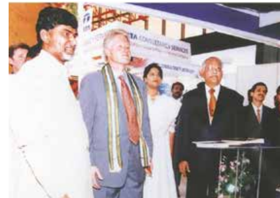
Apollo Aragonda inaugurated, First telemedicine facility in the country inaugurated at Aragonda by Bill Clinton, the Hon'ble President of the United States.