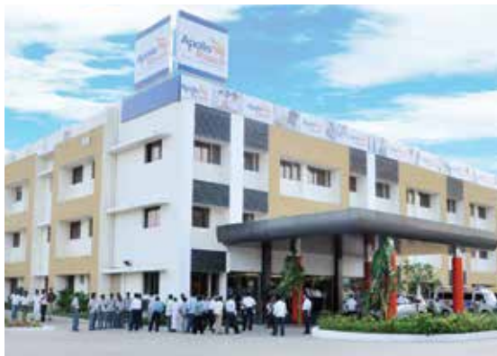
Apollo Reach Hospitals at Karaikudi, Tamil Nadu - Taking quality healthcare to the heart of India.