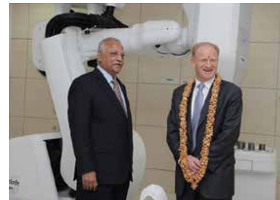
Asia Pacific's most advanced Cyber Knife(r) launched at Apollo Specialty Cancer Hospital.