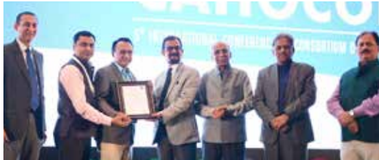
Apollo Hospitals, Ahmedabad won 1st Price in CAHO Healthcare Award 2019

Apollo Hospitals, Chennai launched South India's first Advanced Centre for Movement Disorders