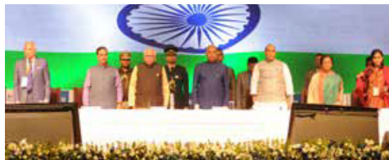
Apollo Hospitals Group has launched a 330-bedded super speciality hospital in Lucknow - the Apollomedics Super Specialty Hospitals