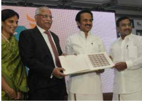
The Government of India releases a commemorative stamp felicitating Apollo Hospitals pioneering spirit.