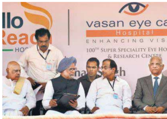
Dr. Manmohan Singh, Hon'ble Prime Minister of India, inaugurates The Apollo Reach Hospitals.