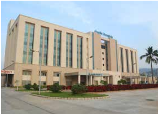
Apollo Heart and Kidney Hospitals inaugurated in Vishakhapatnam.